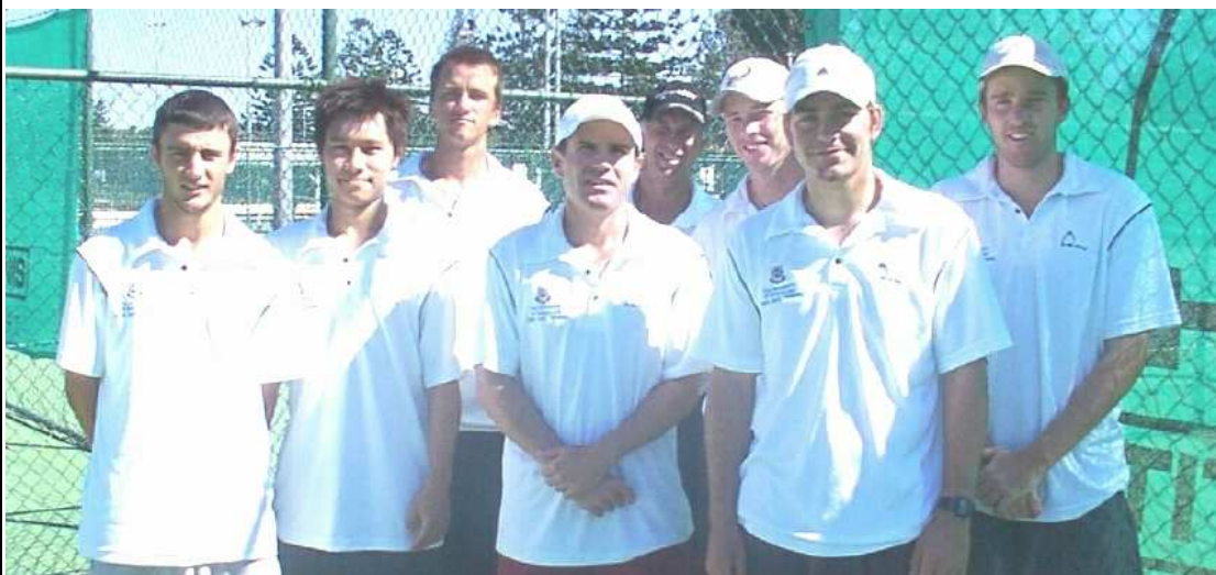
UNIVERSITY OF QUEENSLAND MEN'S TEAM - 2003 INTERVARSITY CHAMPIONS