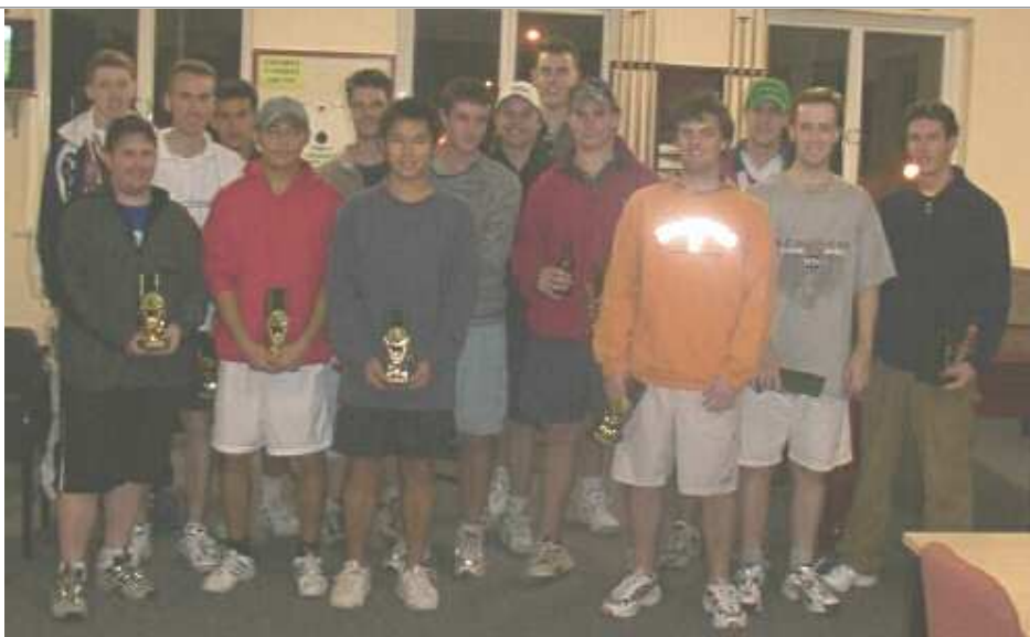
2003(1) UQTC MONDAY FIXTURE WINNERS

The individual championships have been revived so the 2003 AUTC will include Open Men's Singles, Open Ladies' Singles, Open Men's Doubles & Open Ladies' Doubles Championships in addition to the main Teams Competition.