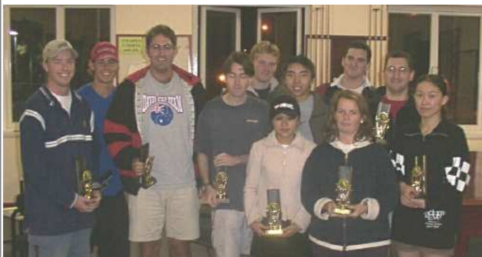
2003(1) UQTC THURSDAY FIXTURE WINNERS