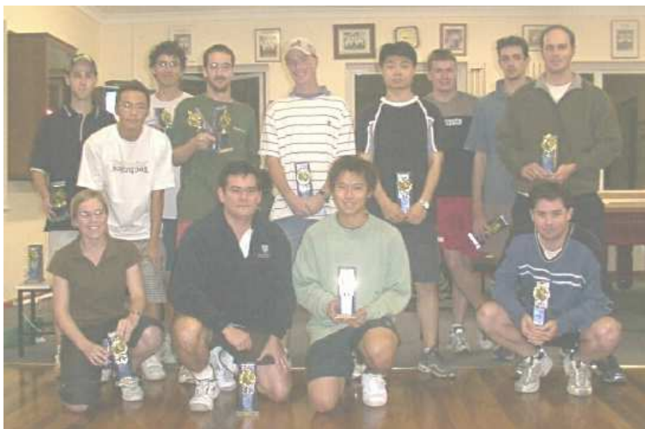
UQTC MONDAY NIGHT FIXTURE WINNERS