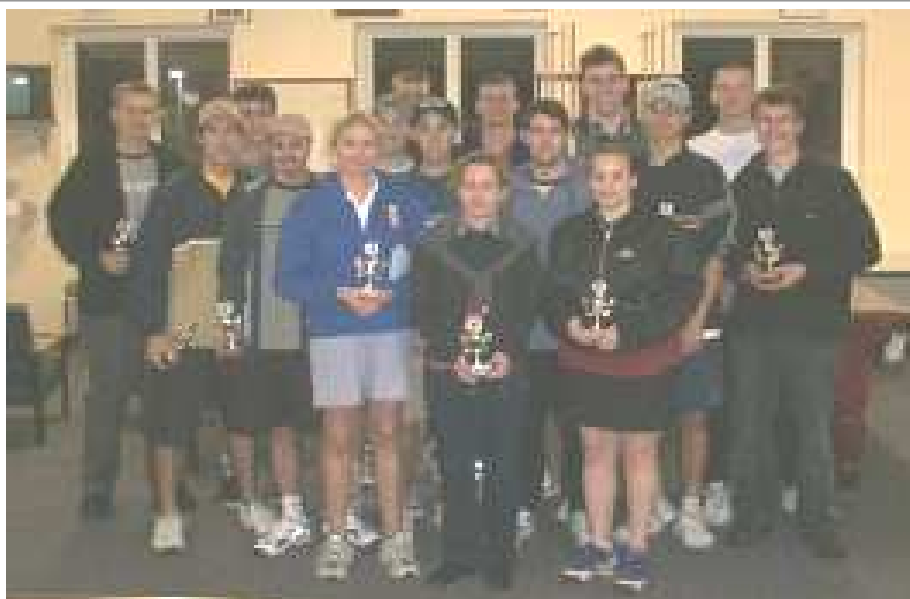
UQTC Monday Fixtures - 2002(1) Winners